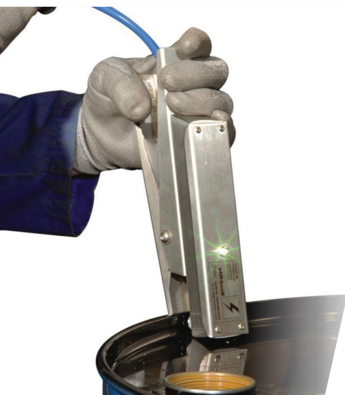
Bond-Rite Clamp: Pulsing LED confirms equipment is grounded

Please Note: The Bond-Rite CLAMP does not check if the site's verified earth grounding point is connected to the general mass of earth. It is the responsibility of the site owner to ensure that their installed ground network is connected to general mass of earth in line the relevant national standards.