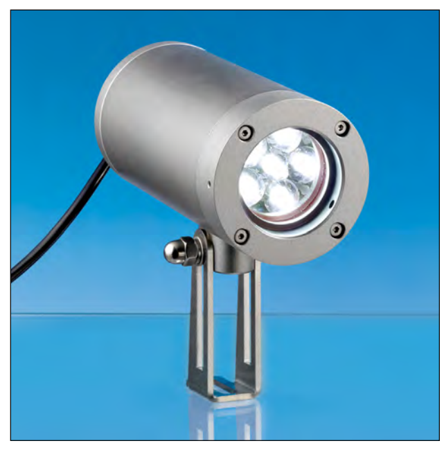
Lumistar luminaire ASL 55-LED-Ex