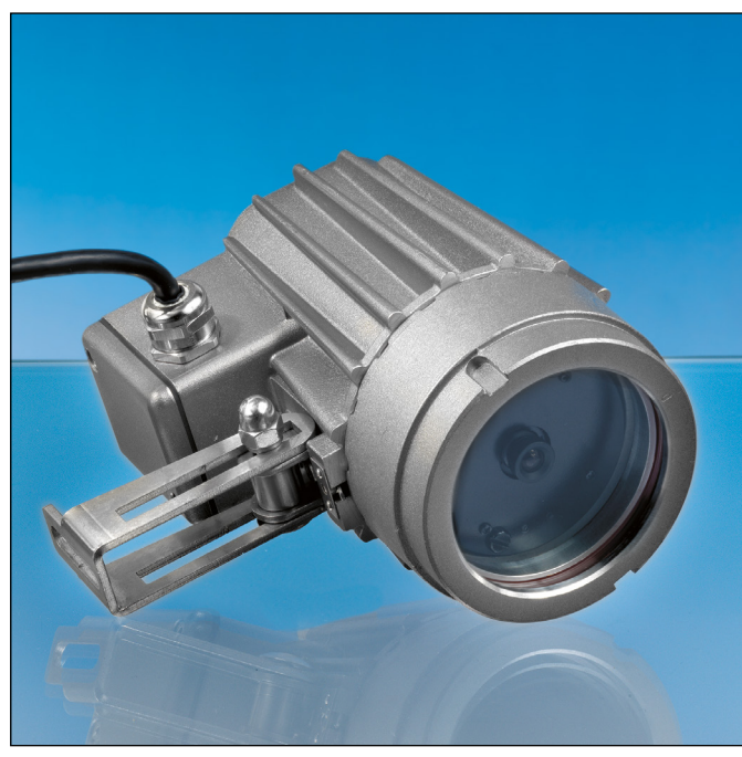
VISULEX Ex-Camera K06A-Ex with fixed lens