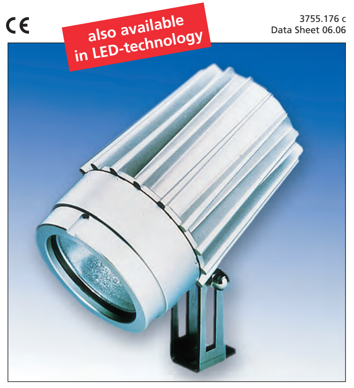
Lumiglas luminaire USL 06 with hinged bracket fastening