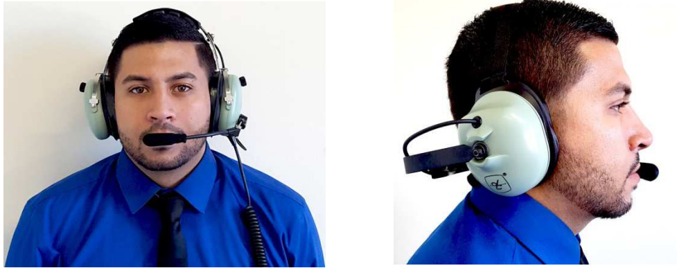
Figure 2: Positioning the Microphone