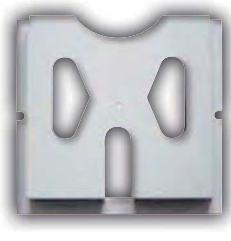
Door document holder opti.