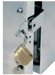
Security padlock Hasp opti.